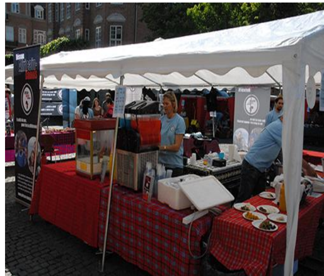
Volunteers at Market Fair 2009